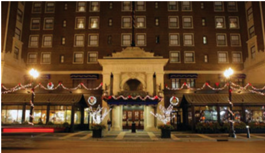
The Amway Grand Plaza Hotel in Grand Rapids, Mich. is a luxury property, so clean water and comfort are vital.

But despite the combination of classic grandeur and modern grace, the task of keeping rooms cool through sultry Midwestern summers was anything but elegant.